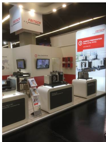
FRITSCH • Milling and Sizing at POWTECH 2017

Since more than 15 years FRITSCH is part of the Trade Fair POWTECH!