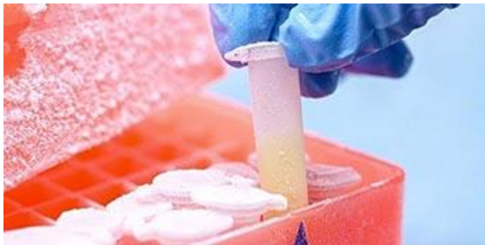
Image caption : CELLBANKER® series of cell freezing media offer high cell viability (>90%) in serum, serum-free, GMP and DMSO-free formats

the vascular remodelling that underlies cardiovascular diseases is the ability to perform reliable single-cell analysis of vSMCs. Large-scale solutions for single cell analysis and the tracking of cell fate using microarray technologies are well established. However, challenges exist when working with freshly isolated vSMCs, as these quickly deteriorate in buffer and there is a limited time before they lose their native phenotype in culture. To reduce animal use and maximise the number of viable cells, establishing a protocol for robust cryopreservation of native vSMCs is critical.