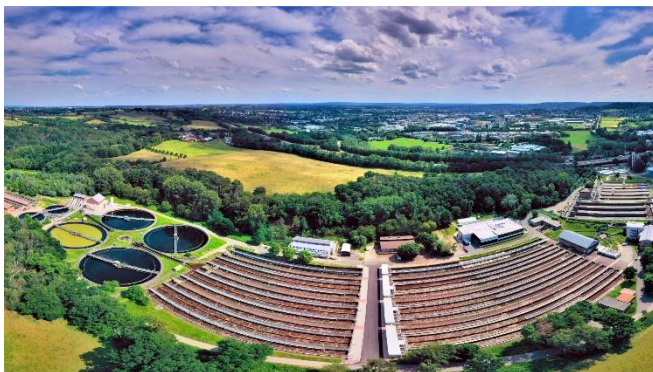
Image 3: The Aachen-Soers wastewater treatment plant of the Eifel-Rur Water Association (WVER) is the city’s largest with large-scale ozonation. The Fraunhofer ILT is cooperating with the WVER in the development of the new inline- measurement technology.