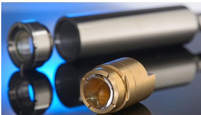
Image 2: As part of the REACT-EU program, the “FluoMonitor” project brings together expertise from the fields of optics, water management and analytics to evaluate the potential and feasibility of multidimensional fluorescence probes for inline liquid analysis. High-precision beam guidance is essential.