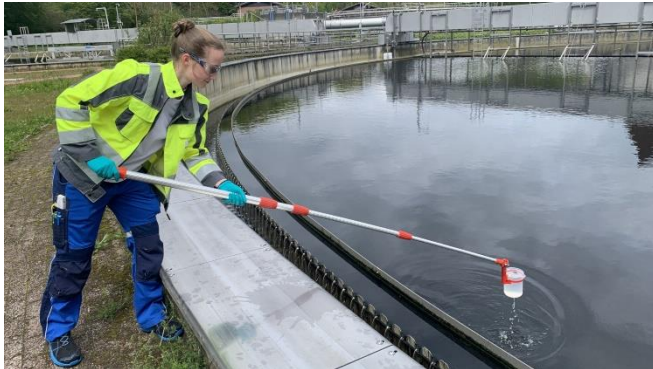
Image 4: The new inline measurement method is intended to supplement and in many cases replace random manual sampling, such as here at the Aachen Soers wastewater treatment plant of the Eifel-Rur Water Association.