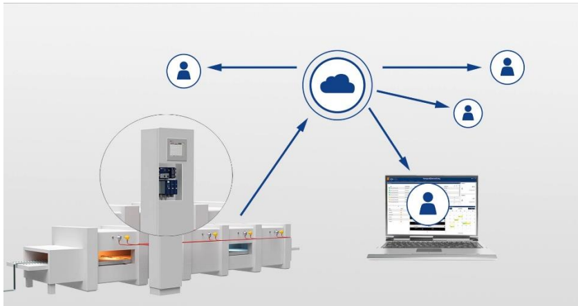
Fig. 4: JUMO Cloud

As an IoT platform for process visualization as well as for data acquisition, evaluation, and archiving, the JUMO Cloud enables worldwide access to measurement data using common web browsers. It is characterized by a high degree of security along with valuable visualization, alarm, and planning functions. Customers can use the JUMO Cloud to monitor several plants that are scattered, processes, or sites in one dashboard, which, in turn, increases process reliability. The possibilities provided by the JUMO Cloud span from simple alarm messages through to condition monitoring and complete plant controls.