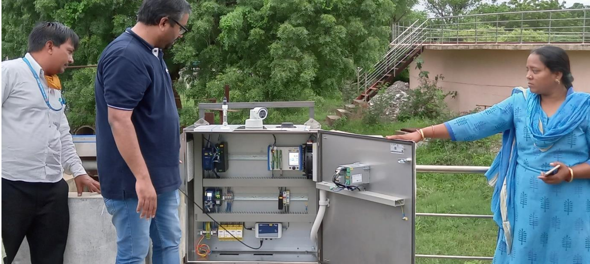
Fig. 1: Picture of the plant in Solapur

The State Agency for Environmental Technology and Resource Efficiency Baden-Württemberg (Landesagentur für Umweltechnik und Ressourceneffizienz Baden-Württemberg) and the Fraunhofer Institute for Interfacial Engineering and Biotechnology IGB have worked hand in hand with JUMO GmbH & Co. KG and other industry partners in Solapur to implement a showcase project for simple monitoring of water quality.