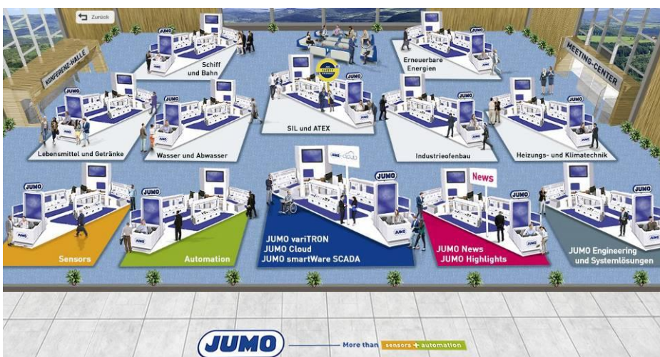
2: 12 exhibition stands with product and industry innovations await visitors