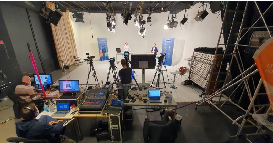
3: A professional film studio was used to broadcast the live streams.