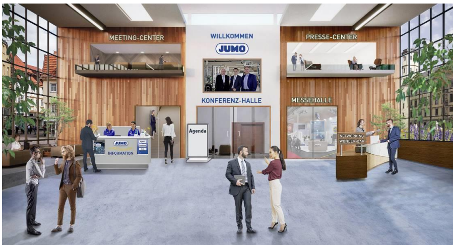
1: View into the lobby of the JUMO Xperience Days

The visitor response to the Experience Days was consistently positive. The high quality and professionalism of the livestreams and the numerous interactive communication options were particularly praised. The clear structure and ease of use of the software platform was also a big plus from the participants' point of view.