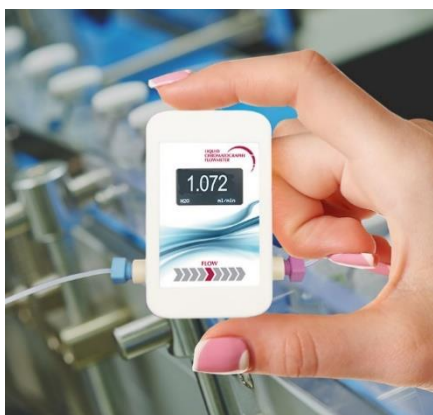
Caption: Liquid Chromatography flowmeter