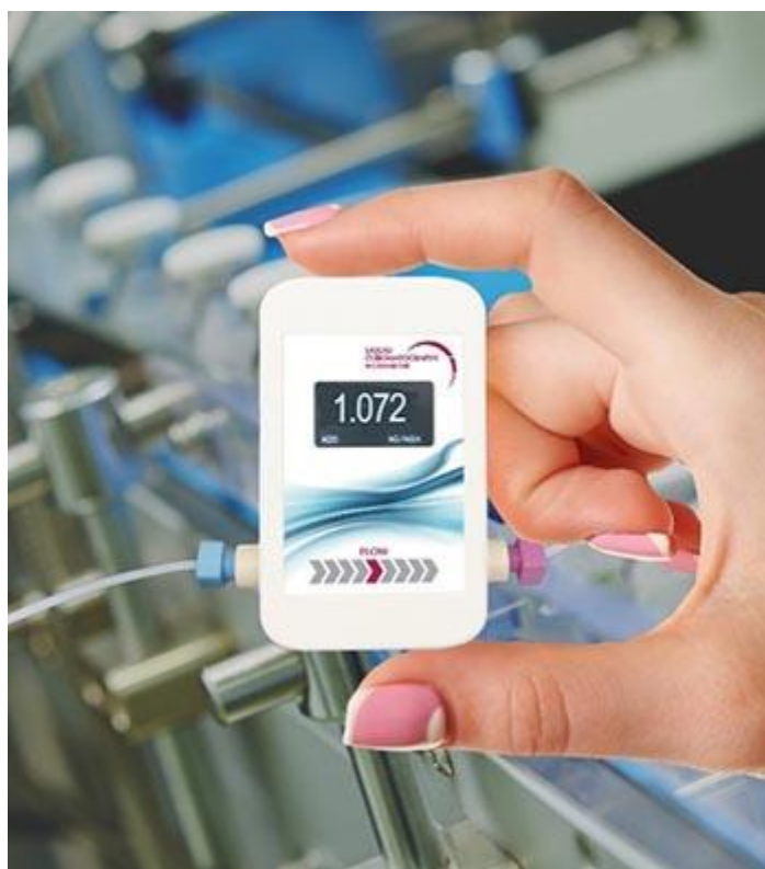
Caption: non-invasive flowmeter for monitoring HPLC pump flow

TESTA Analytical has published a new technical study that demonstrates the utility of its non-invasive liquid flowmeter for validating the performance of HPLC systems across a wide range of different solvents .