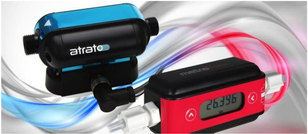
Caption: Atrato & Metraflow ultrasonic flowmeters

Illustrative images (available on request):