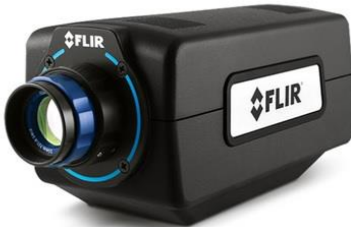
FLIR A8200sc MWIR camera

Compact in design, FLIR Systems A8200sc and A8300sc MWIR cameras offer the speed and sensitivity researchers need to capture rapid thermal events and record the most accurate temperature measurements